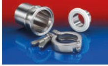
CONNECT TRI-CLAMP FITTING 245