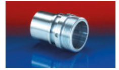
CONNECT THREAD FITTING 234