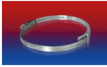
CLAMP 210 BRIDGE CLAMP