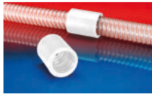
CONNECT 246 FOOD