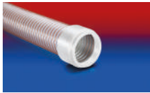
CONNECT 245 FOOD