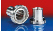
CONNECT DAIRY FITTING 247