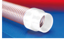
CONNECT 240 + 241 FOOD