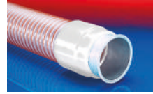
CONNECT 243 FOOD