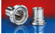
CONNECT ASEPTIC FITTING 249