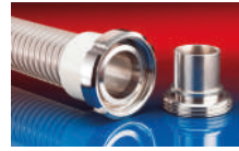
CONNECT MOULD ASSEMBLY 233